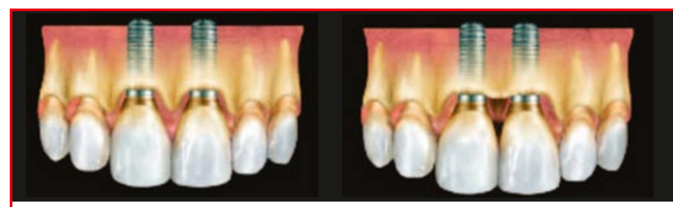
Figure 4: Implants placed 3mm apart do not allow bone loss to overlap, while implants placed closer than 3mm together result in overlap and additional loss of crestal bone (from Jiraj S and Chee W, 2006).