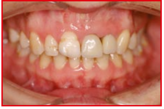
Figure 7: Patient with temporary implant crowns on 21 and 22. At time of implant placement, a connective tissue graft was taken from the palate to thicken the soft tissue biotype and create more soft tissue volume. Note the tissue deficiency still present between 21 and 22.