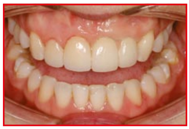
Figure 10: Veneers and bridge cemented (day of insertion). Note the use of pink porcelain for the 21/22 bridge. As the tissue matures the soft tissue aesthetics will improve further. Access for hygiene must be made possible to cleanse the area.

5. Papillary Illusion: This may be achieved prosthetically with the use of elongated contact points or the use of "pink" porcelain to give the appearance of soft tissue (Figure 7-11).