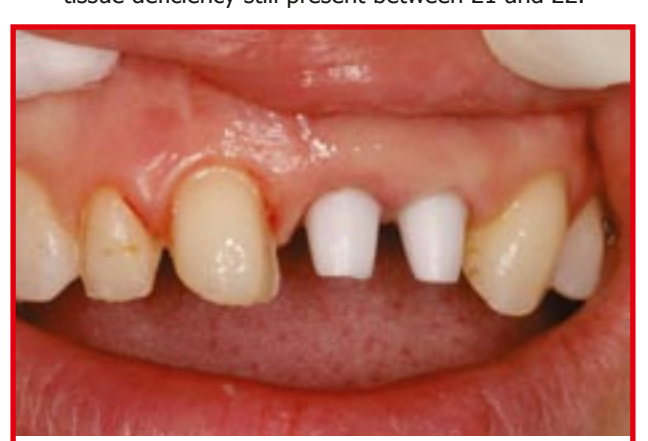
Figure 8: Veneer preparations 11, 12. Procera Zirconia abutments fitted on 21, 22. Note the deficient soft tissue height between the two implants.